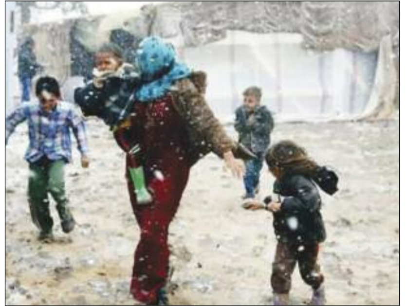
Syrian families trapped in snow-covered mountains...they need to be helped to escape

(Donations for the Syrian Refugee Family project may be sent to: Archbishop's House 41-43 Cathedral Road Cardiff CF11 9HD)