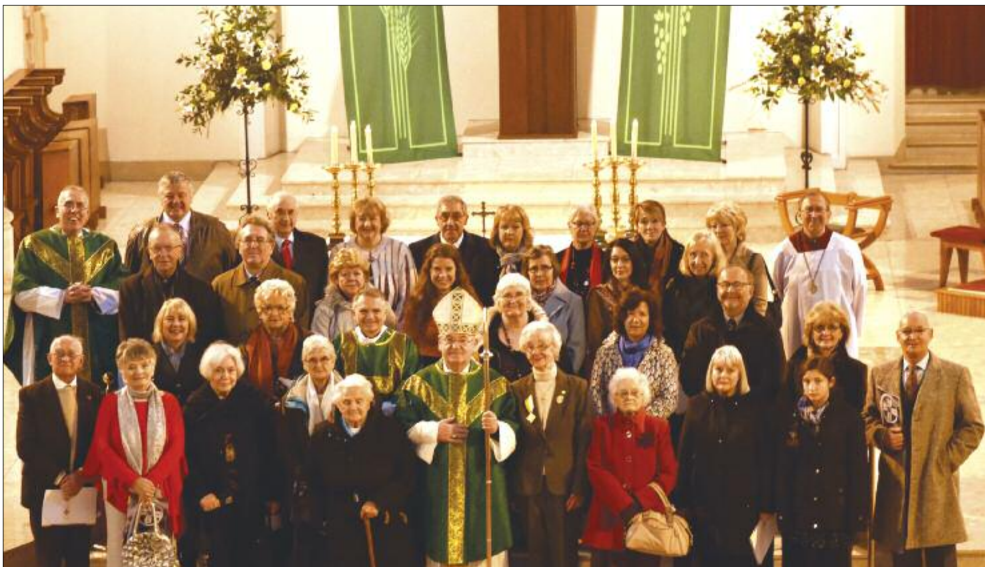
Representatives from all the parishes attended the Mass in Thanksgiving for the Conclusion of the Centenary