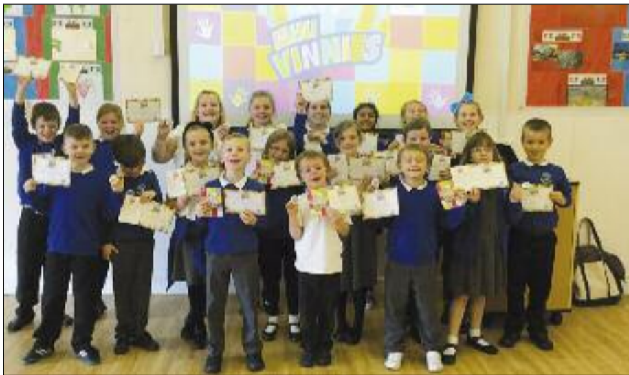
Pupils at St Cuthbert’s make their Mini Vinnie

Young Vincentians - a growing group commissioned in the Archdiocese