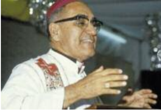
The Blessed Oscar Romero

2017 is the centenary year of the birth of Blessed Oscar Romero, born 15th August 1917. Following a petition from the Archbishop of Southwark, the Most Rev. Peter Smith, formerly Archbishop of Cardiff, to have Blessed Oscar Romero added to the liturgical Calendar of the Diocese, the Congregation for Divine Worship and the Discipline of the Sacraments, by virtue of the faculties granted to it by Pope Francis, has granted that a 'liturgical commemoration' may be celebrated annually in St George's Cathedral, Southwark, on the 24th March, the anniversary of his martyrdom. Although the Archdiocese did not meet the criteria for having Blessed Oscar Romero added to the diocesan calendar, it was recognised that 'the Cathedral is home to a national shrine... and contains a number of his relics...' and so the request was granted for the Cathedral. Archbishop Peter was very pleased to have received this permission, as was The Archbishop Romero Trust which encouraged and supported the application, believed to be the only such granted outside Central America. His Grace said "I am delighted that the Holy See has approved this request, and hope that the example and prayers of Blessed Romero will prove a blessing to the diocese and to all who visit the Cathedral".